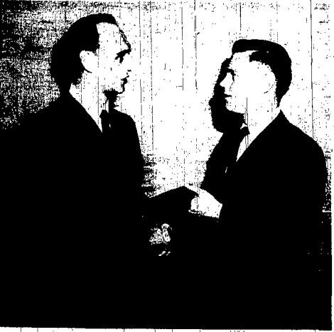
received the "Outstanding Jaycee" award for work done during the year. A third award, "Outstanding Committee Chairman"...