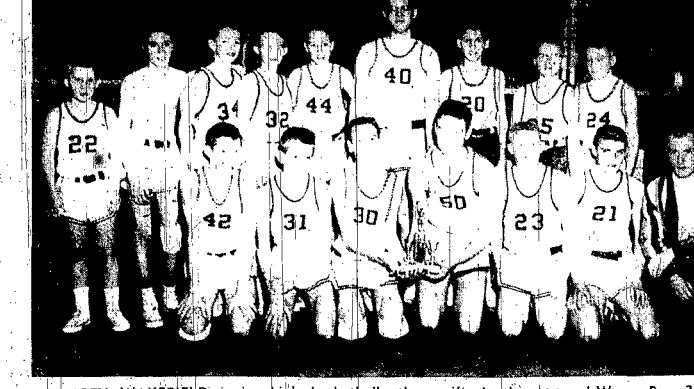
A HAPPY WAKEFIELD junior high basketball team took home the first place trophy in the annual Wayne Junior High tournament completed Saturday.